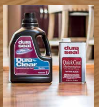
Clear, non-ambering look that lasts